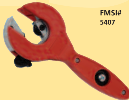
FMSI# 5407 DESCRIPTION Large Ratcheting Tube Cutter 1/4" to 7/8" (6 - 23mm) easily cuts steel, copper, aluminum and stainless steel tube in confined places (spare cutting wheel included)