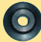
FMSI# 5409 DESCRIPTION 10 Pack Standard Replacement Cutting Wheels - used with FMSI #5406, 5407, and 5408.