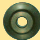
FMSI# 5410 DESCRIPTION 10 Pack Hardened Replacement Cutting Wheels - used with FMSI #5406, 5407, and 5408. (Stainless & hardened steel)