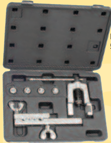
FMSI# 5405 DESCRIPTION Metric Hardened Bubble Flaring Tool 3/16" (4.75mm) - 6mm - 8mm & 10mm Hard Plastic Case

Available separately 3/16" replacement flaring adapter FMSI #5412