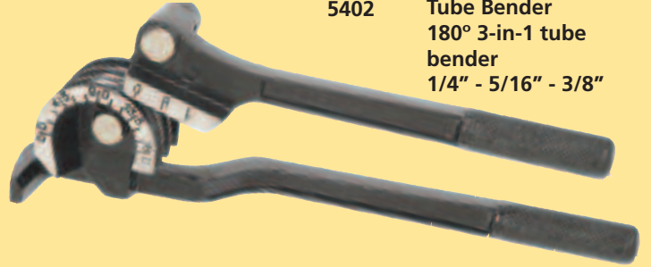
FMSI# 5402 DESCRIPTION Tube Bender 180° 3-in-1 tube bender 1/4" - 5/16" - 3/8"