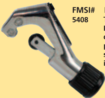
FMSI# 5408 DESCRIPTION Telescopic Tube Cutter and Reamer 1/8" to 1-1/8" outside diameter easily cuts steel cop- per, aluminum and stainless steel tube (spare cutting wheel included)