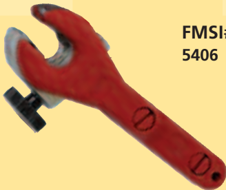
FMSI# 5406 DESCRIPTION Small Ratcheting Tube Cutter 1/8" to 1/2" outside diameter easily cuts steel, copper, aluminum and stainless steel tube in confined places (spare cutting wheel included)