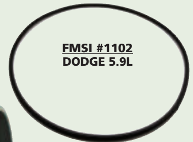
FMSI #1102 DODGE 5.9L